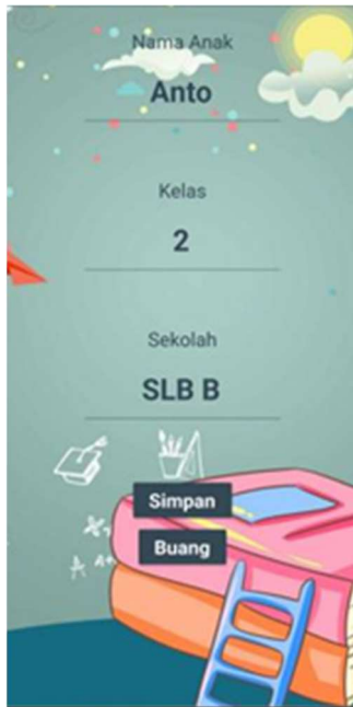
Fig. 5 Child Identity

Table III exhibits the expert assessments, with individual scores provided for reference.