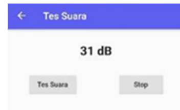
Fig. 3 Sound Test - Sound and Rhythm Perception Assessment

Furthermore, Fig. 3 displays the sound test menu, designed to gauge ambient sound levels for teacher assessments. This test employs decibels (dB) as its unit of measurement.