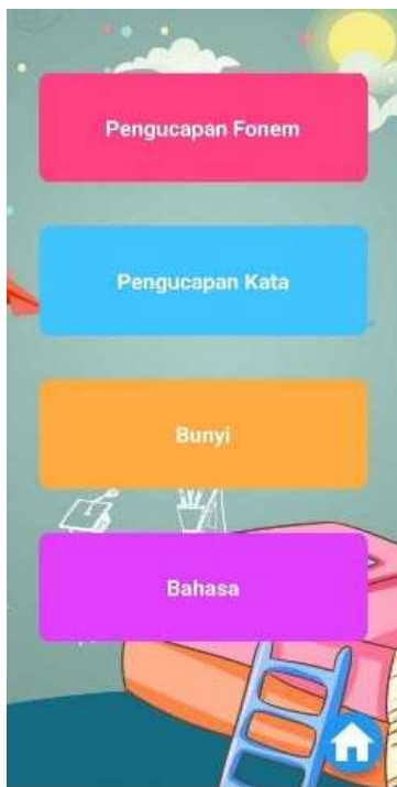
Fig. 1 The Main Menu of the Perception of Voice and Rhythm Assessment Application

Fig. 2 depicts the competency test menu, encompassing phoneme pronunciation, word pronunciation, voice, and language assessments.