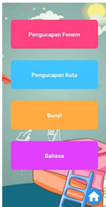
Fig. 2 Competency Test - Voice and Rhythm Perception Application

Fig. 2 depicts the competency test menu, encompassing phoneme pronunciation, word pronunciation, voice, and language assessments.