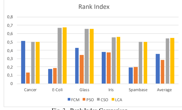
Fig. 3 Rank Index Comparison

The overall average of accuracy is showed in figure 2. It can be viewed that the proposed approach is better than CSO based clustering. Meanwhile based on rank index which is illustrated in figure 3, it can be seen that both techniques have almost similar result in average.