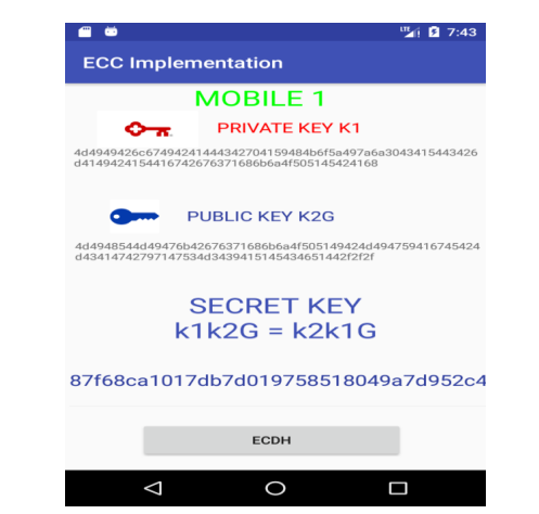
Fig 4. ECC Implementation on Android

The two devices only disclose their public keys and the shared key is calculated. The same shared key is used by the devices to encrypt and decrypt the data.