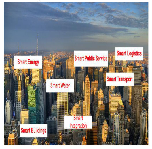
Fig 1: Smart City

residents. While developing the solutions for its users in a smart city, huge amount of data is collected and the possibility of data breach is evident in such scenarios. The Figure 1 provides general over view of a smart city with capabilities to have smart energy, smart education, smart logistics and many more features.